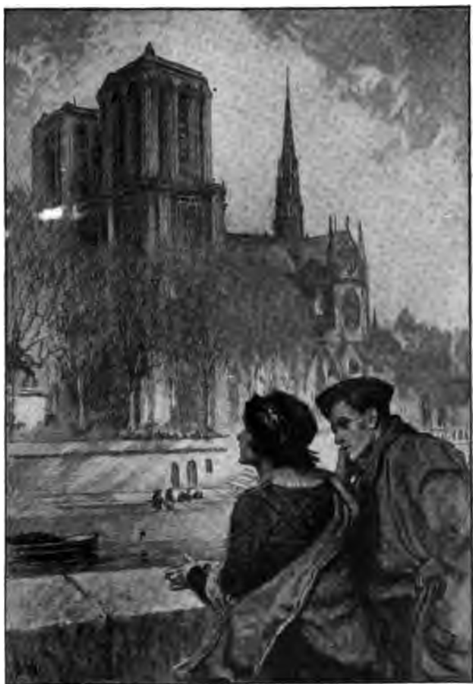
THROUGH MOIRA'S CLEAR INTELLIGENCE THE EPIC FILTERED